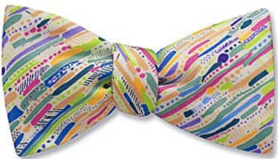
Mendell’s Playland Bow Tie