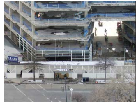
Photographs © Hickok Cole Architects